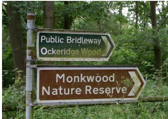
Signs at the reserve's entrance