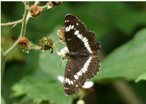
White Admirals seem particularly prone to wing damage, presumably by bird attacks