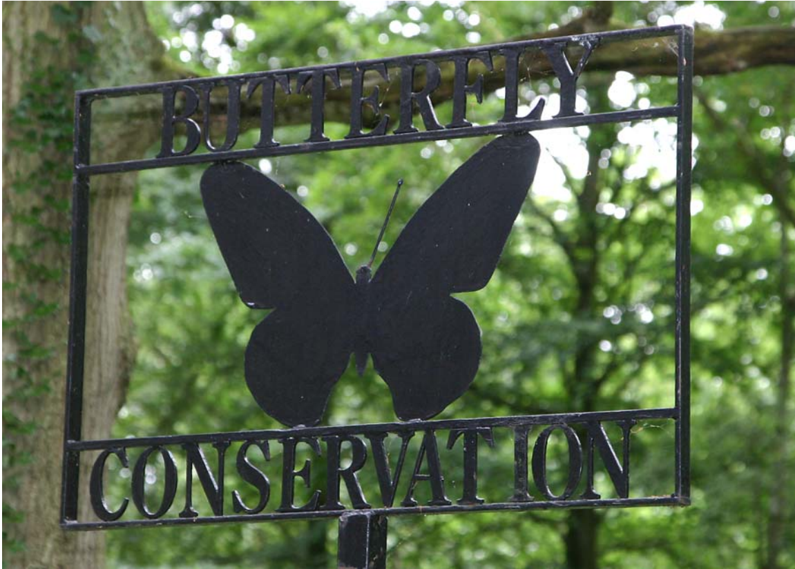
Entrance to Monkwood reserve