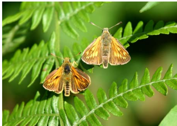
Male (below) and female Large Skippers