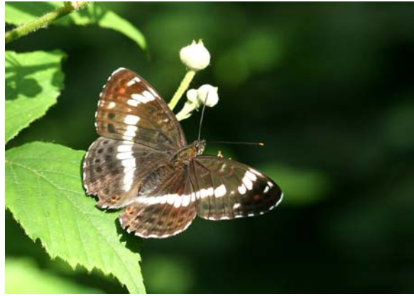
White Admiral on bramble blossom