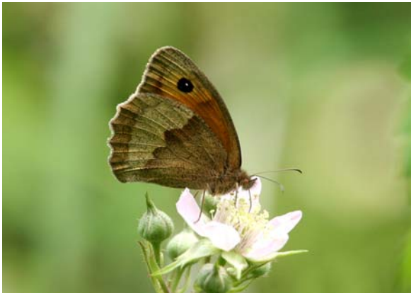
Meadow Brown on bramble blossom