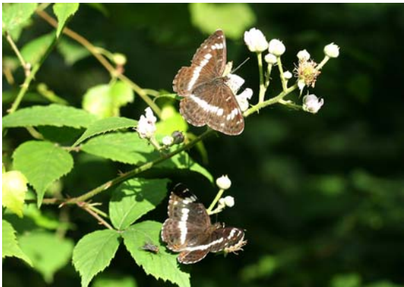
White Admirals may easily be seen in July

When I went there in July 2008, there was a stunning display of White Admirals. Generally you see these one at a time, but at Monkwood there were three or four nectaring on each bramble bush, a wonderful sight. Because it was late in their season, many had become worn or pecked by birds, but I shall certainly try to come back earlier in their flight season to see them again.