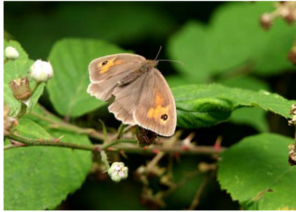
Meadow Brown (f)