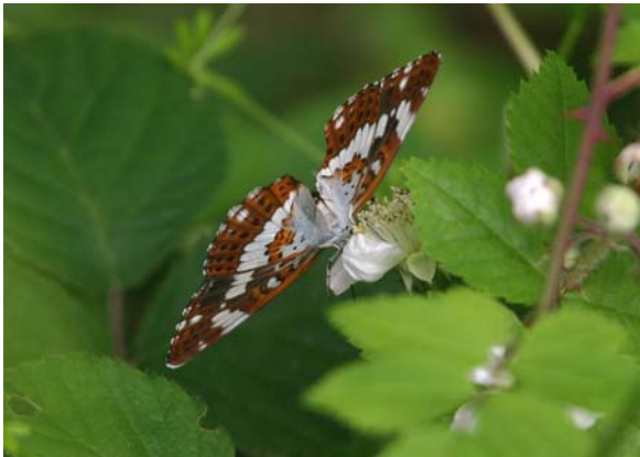
The underside of a White Admiral is more colourful than its upperside