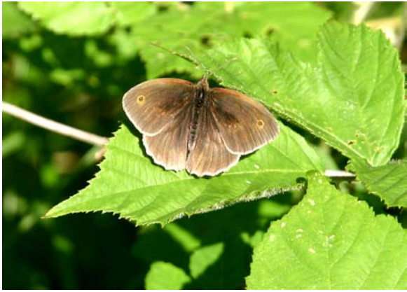
Meadow Brown (m)